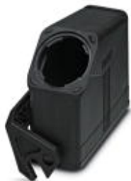
HEAVYCON EVO coupling housing, plastic, with bayonet flange for EVO screw connection, B24, with single locking latch, height: 90 mm, without EVO screw connection

Please be informed that the data shown in this PDF Document is generated from our Online Catalog. Please find the complete data in the user's documentation. Our General Terms of Use for Downloads are valid ( http://phoenixcontact.com/download )