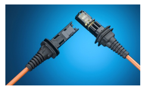
VersaBeam™ POD 1.80mm Jacketed Round Cable Assemblies