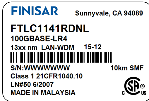
Figure 2. Standard Product Label